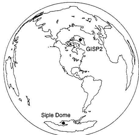
Fig. 1. Location map for GISP2 (Greenland) and Siple Dome (Antarctica).

Although the gradual atmospheric warming during the 20th century (~0.5°C) is almost certainly linked to anthropogenic activity (27) and provides a definite end to LIA cooling (1), other components of the climate system may still be responding to LIA perturbations. As evidence, Sargasso Sea and Santa Barbara Basin surface temperatures have not fully recovered from LIA minima (22, 28). In our records, \text{Na}^+ levels in modern (20th century) sections of each